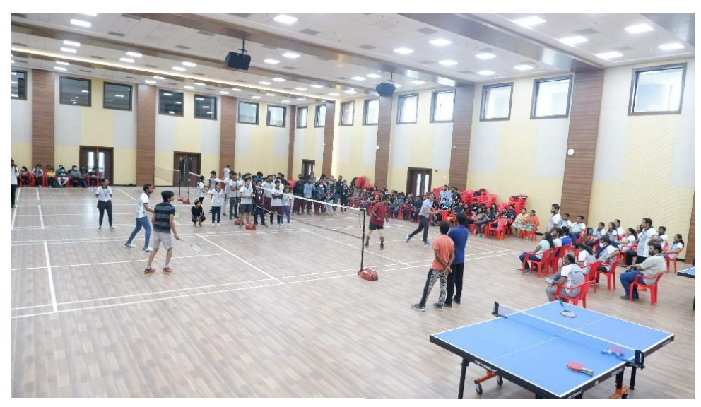
LIBA – Auditorium cum Sports Facility